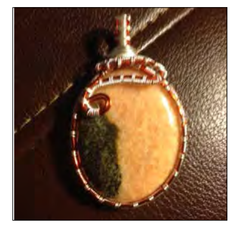
Ballarat Marble, finished piece by Omid Aeen

For the January field trip, members and guests gathered together and collected Diablo onyx and Ballarat marble. They all came home from a gorgeous winter day in the desert with a load of beautiful rock just waiting to be transformed into a work of art.